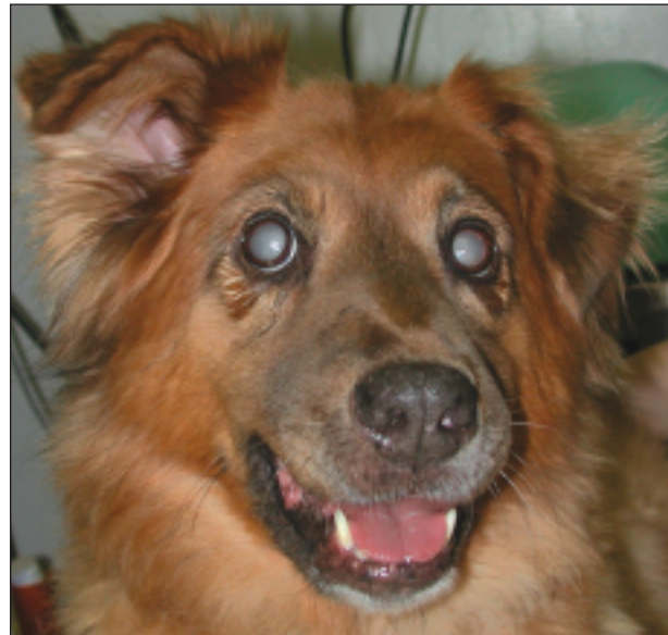
Figure 1. This 9-year-old diabetic dog has bilateral mature cataracts. These rapidly progressive opacities are associated with marked visual impairment.

Phacoemulsification with IOL implantation has been the standard of treatment for cataracts in dogs for the past 25 years. Veterinary ophthalmologists used IOLs (13.00 D) designed for humans until keratometry and A-scan biometry demonstrated very different parameters necessary to achieve emmetropia in aphakic dogs. 1-3 The evolution of IOLs for dogs, however, has closely followed advances in the human field. A canine posterior chamber IOL is 40.00 to 41.00 D, with a biconvex optic measuring 6 to 7 mm in diameter, a peripheral edge to limit posterior capsular opacification (PCO), and a haptic-to-haptic length of 12 to 16 mm. 4 Biometry and keratometry (K) readings vary surprisingly little across the wide range of dog breeds. 2,5 IOL parameters have also been determined for the feline eye. 6 In dogs, axial length